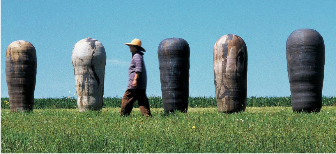
Takaezu walking amongst the Star Series Photo credit: Tom Grotta, 1998